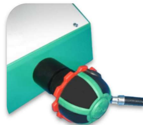
LGDV connected to equipment port for testing