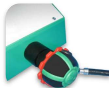
LGDV connected to equipment port