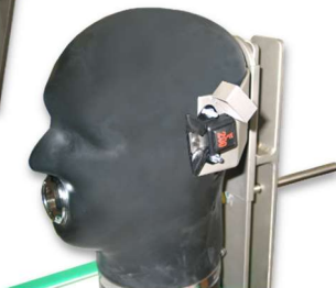
Pneumatic mask tightener with the stainless-steel holder for two-point helmet masks and docking adapters