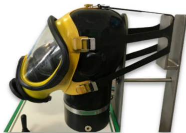
Pneumatically tightened mask on dummy head

Optional accessories for leak testing the valves of chemical protective suits with Multitest 720M plus are available on request.