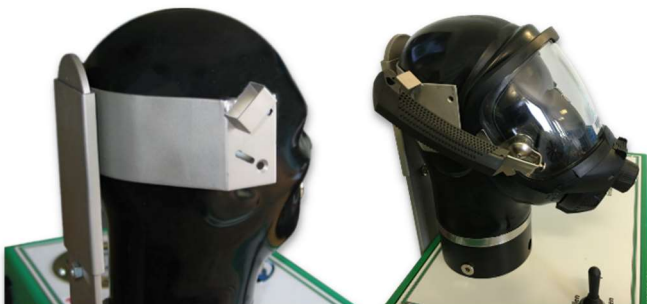
Optional accessory: stainless steel mask holder for docking and testing two-point helmet masks in a particularly convenient manner

We also offer a comprehensive range of accessories for testing two-point helmet masks, including a purpose-built stainless-steel mask holder that is a great help and time-saver, especially if you have to test many two-point helmet masks.