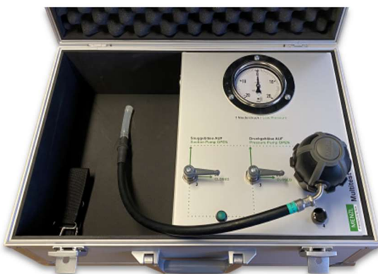
LGDV connected to equipment port

Please note: Optional accessories are sold separately.