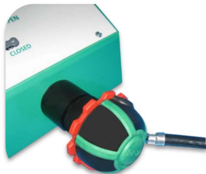
LGDV connected to equipment port

The tester has a round-thread equipment port. Thanks to a broad range of optional adapters (see accessories), it is also possible to test a wide variety of equipment with other connector/port types from a large number of manufacturers.