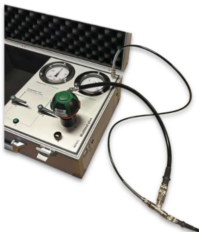
Testing an LGDV with medium pressure

Please note: Optional accessories are sold separately.