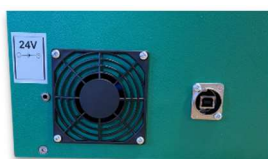
Power jack and USB port

The tester comes with a round-thread equipment port. Thanks to a broad range of optional adapters (see accessories), it is also possible to test a wide variety of equipment with other connector/port types from a large number of manufacturers.