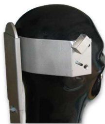
Holder for two-point helmet masks (sold separately)